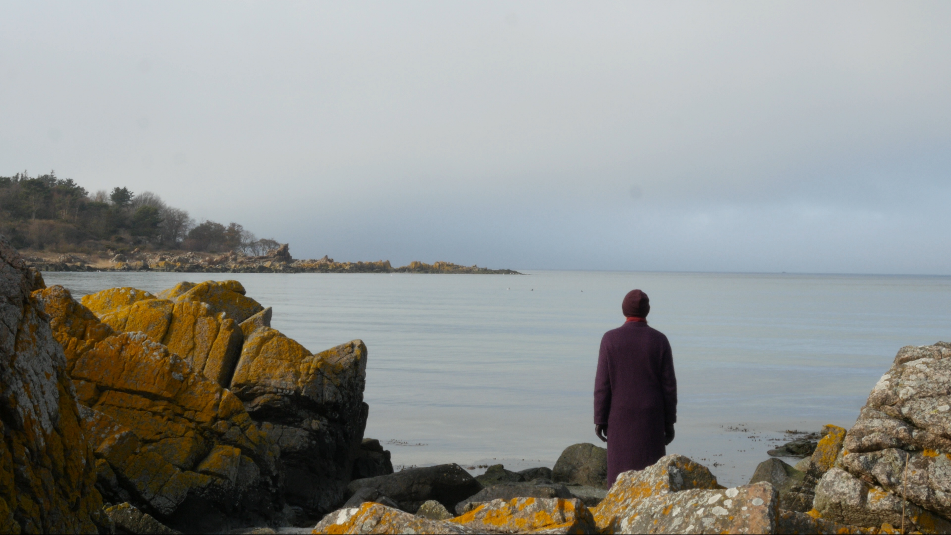
Lichen at Allinge 1-2, Arlander 2016