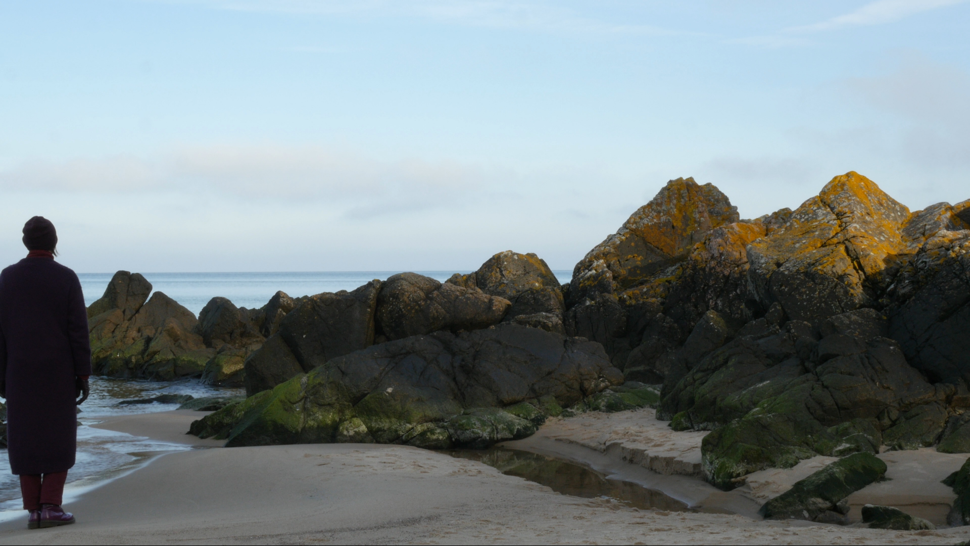
Lichen at Allinge 1-2, Arlander 2016