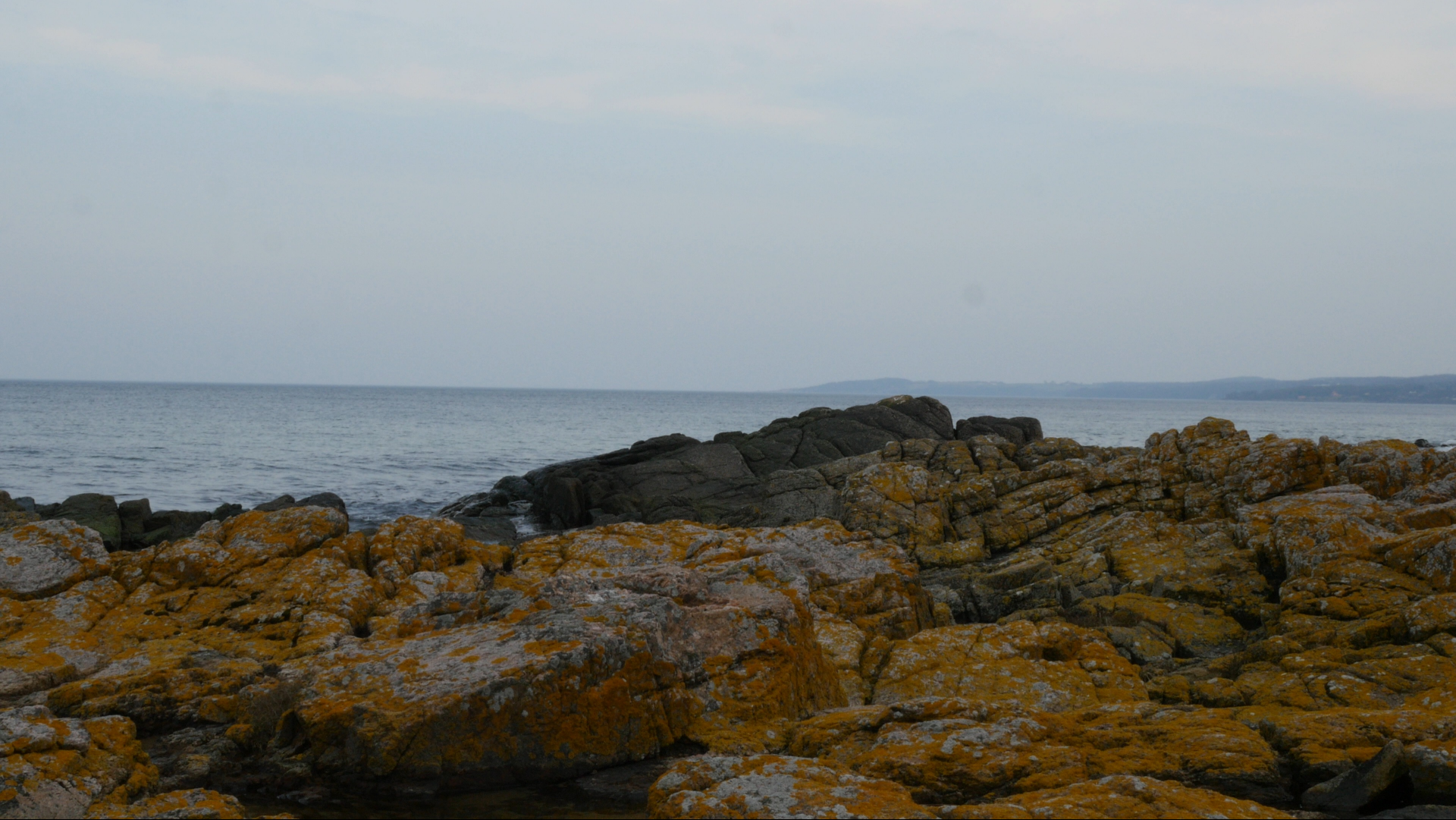
Lichen at Allinge 1-2, Arlander 2016