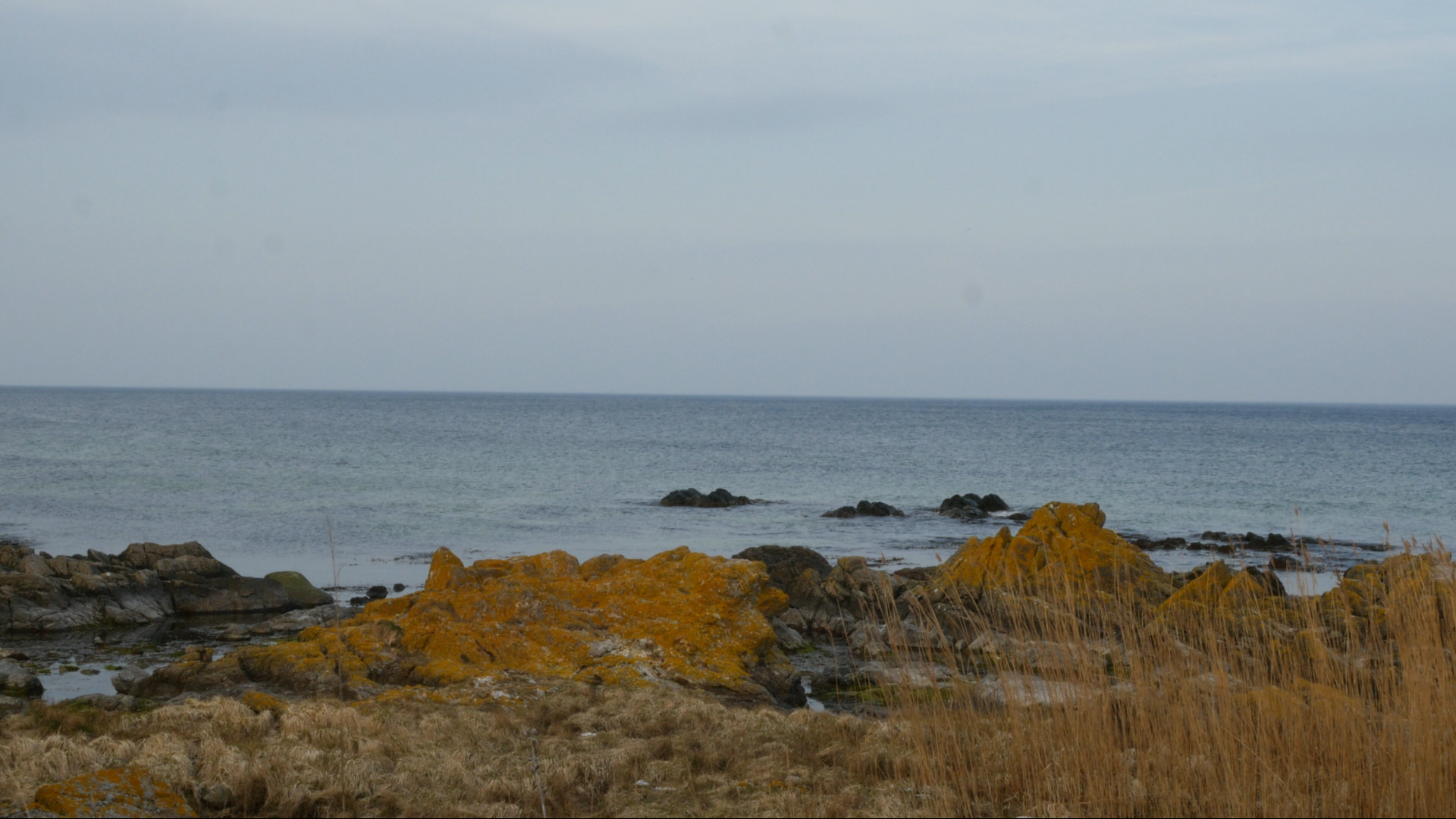
Lichen at Allinge 1-2, Arlander 2016