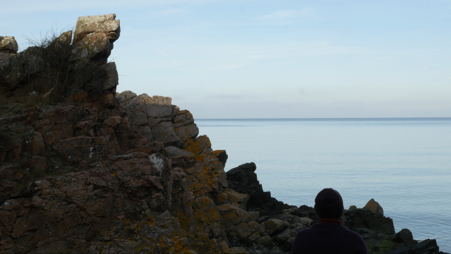
Lichen at Allinge 1-2, Arlander 2016