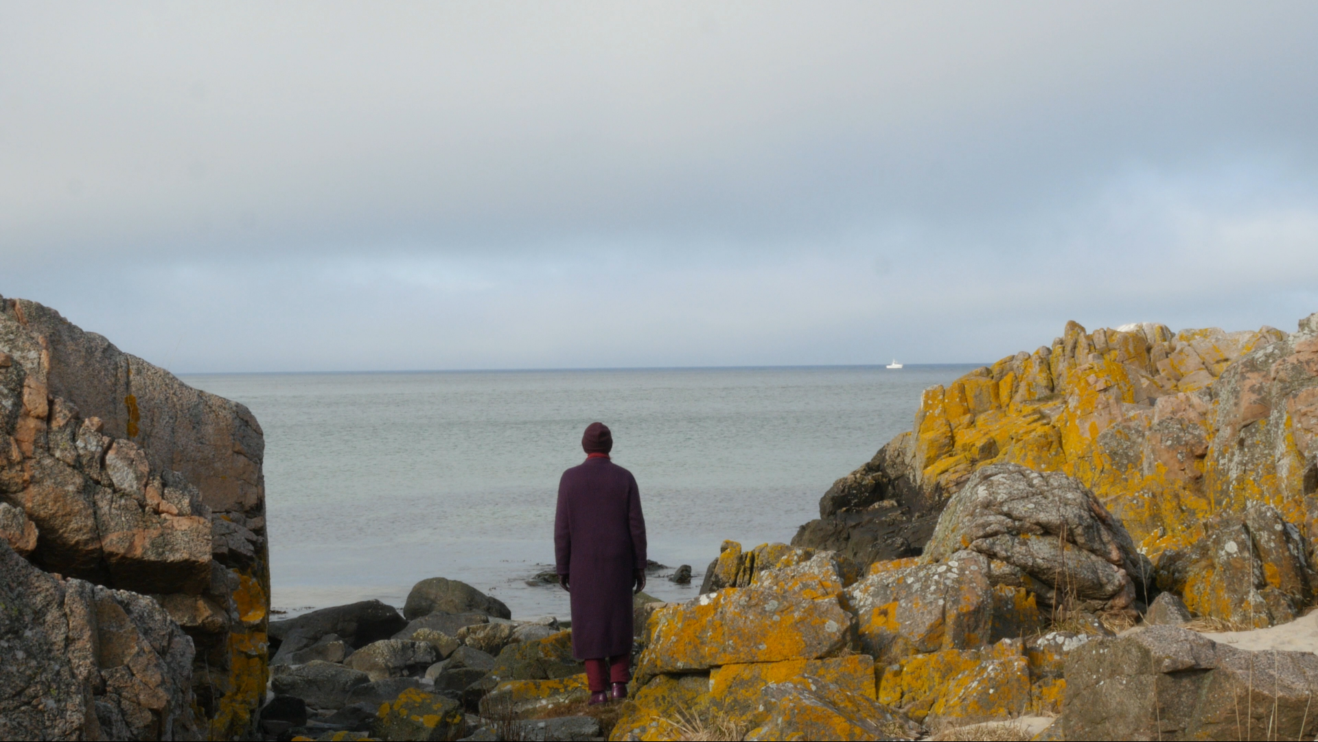
Lichen at Allinge 1-2, Arlander 2016