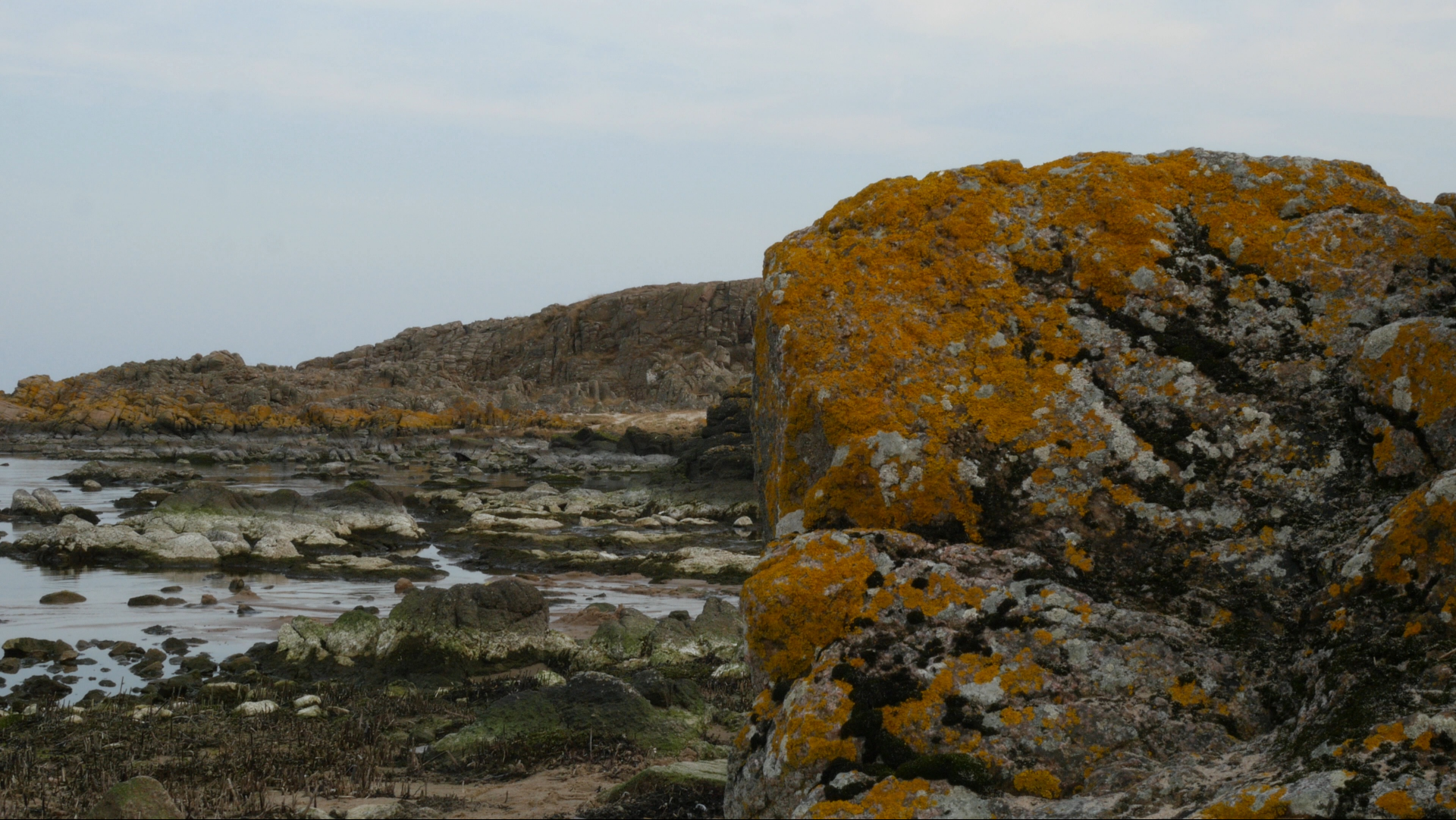
Lichen at Allinge 1-2, Arlander 2016