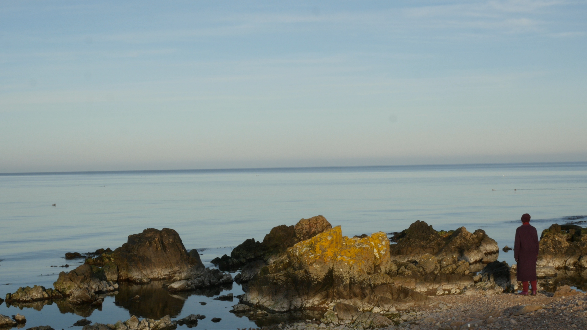
Lichen at Allinge 1-2, Arlander 2016