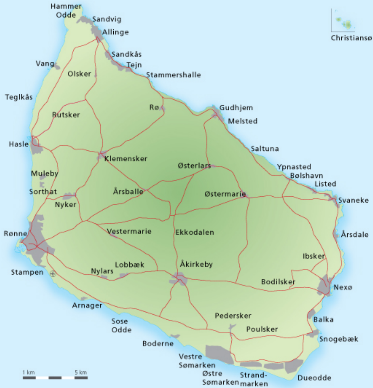
Lichen at Allinge 1-2, Arlander 2016