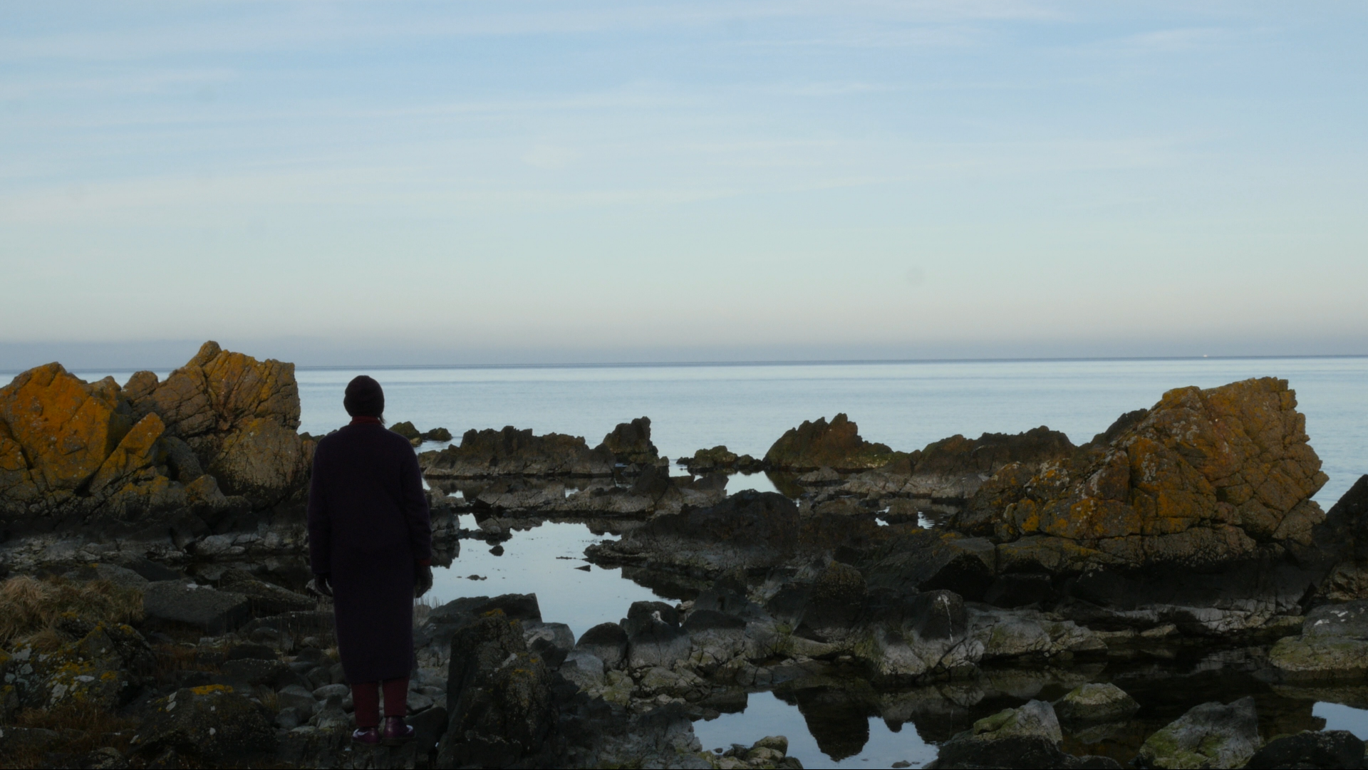
Lichen at Allinge 1-2, Arlander 2016