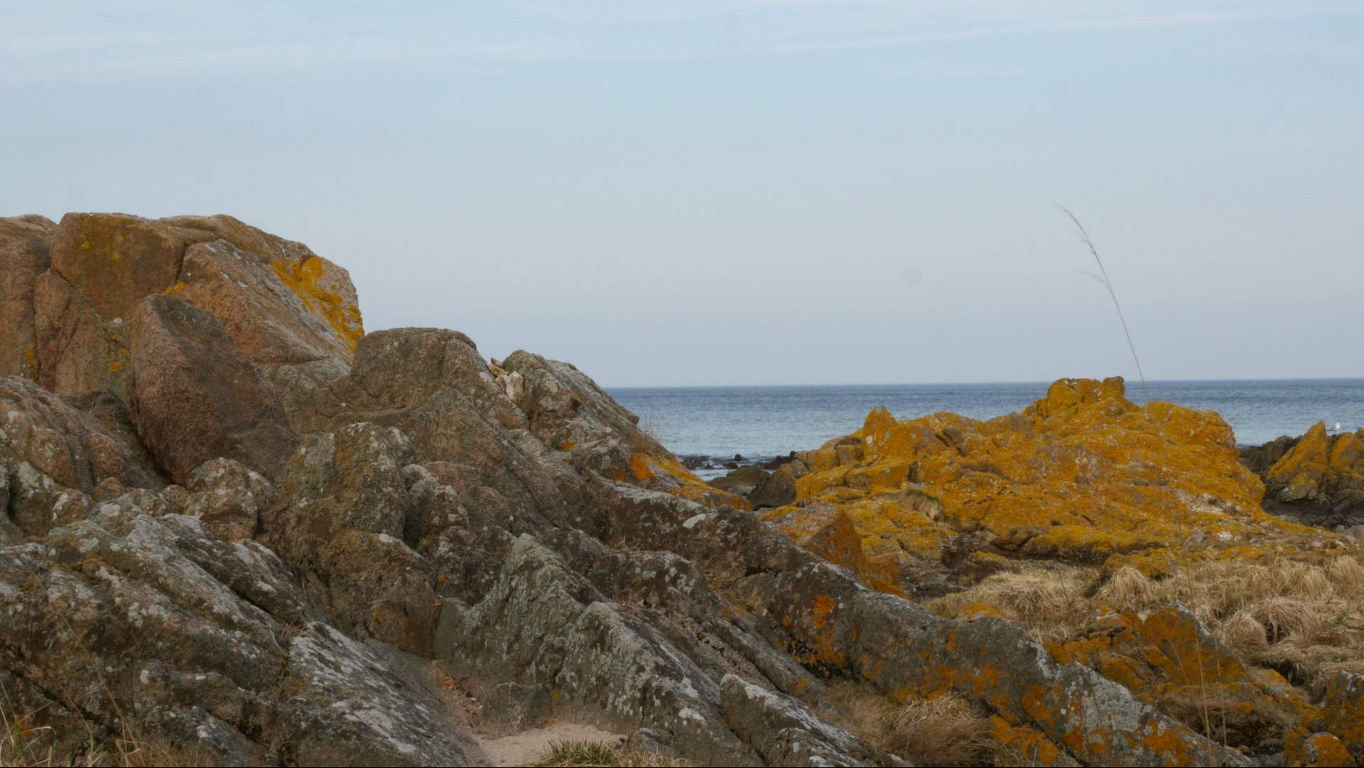
Lichen at Allinge 1-2, Arlander 2016