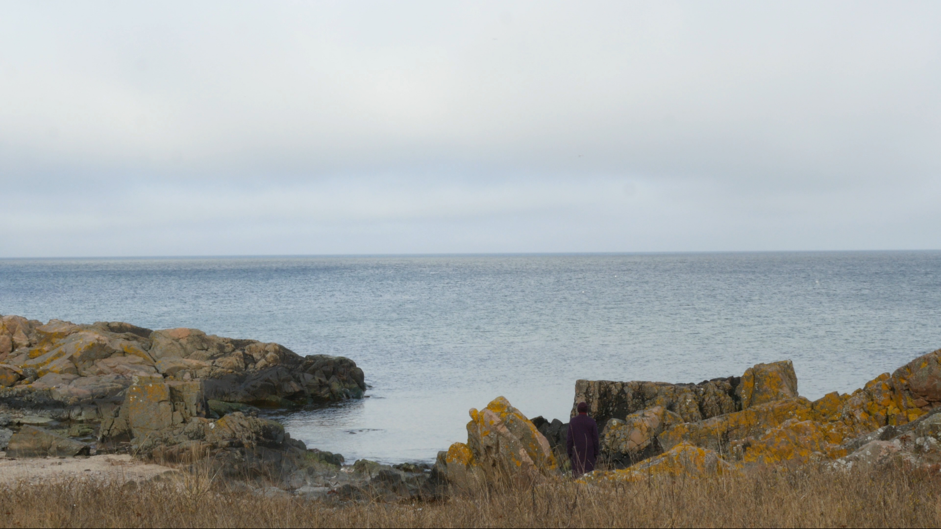
Lichen at Allinge 1-2, Arlander 2016