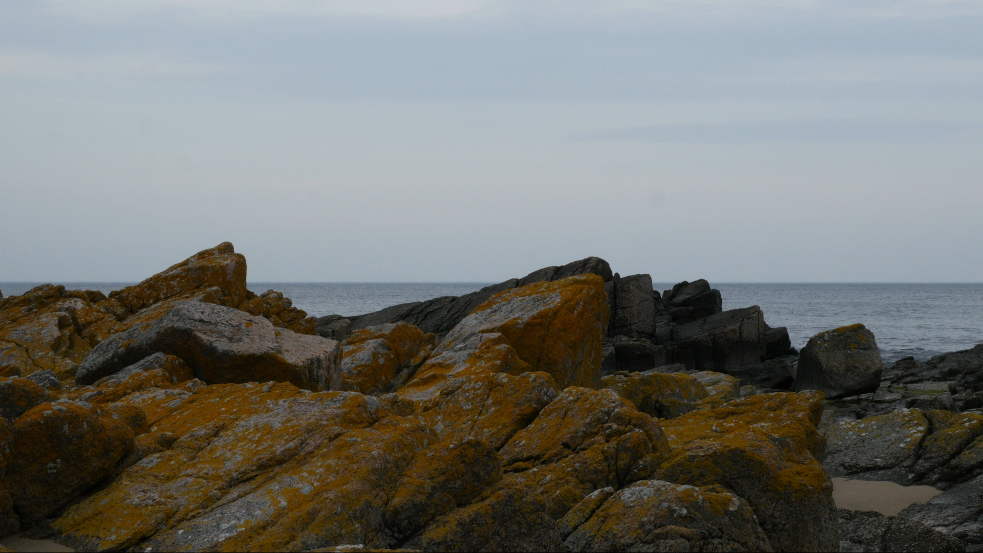
Lichen at Allinge 1-2, Arlander 2016