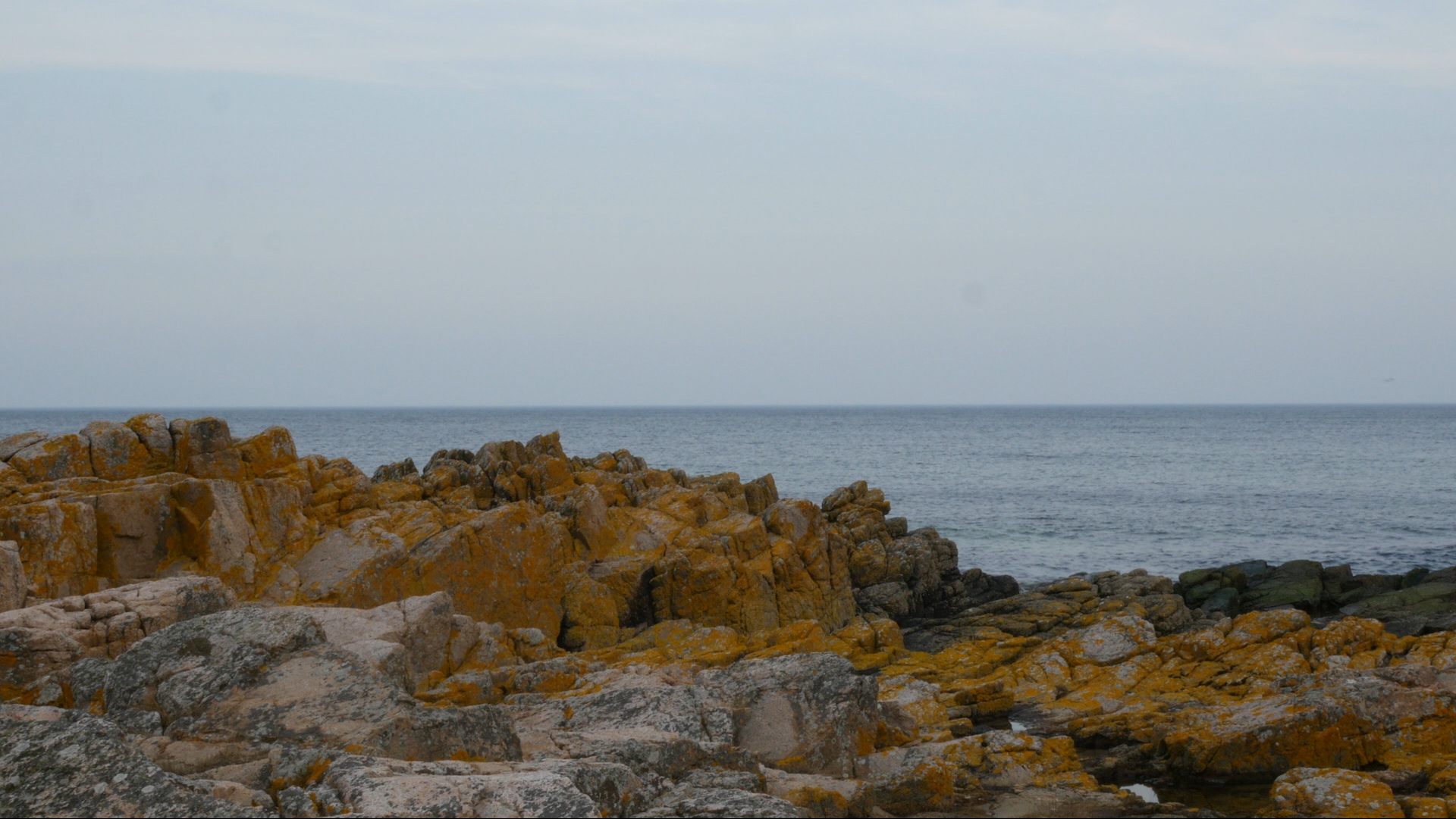
Lichen at Allinge 1-2, Arlander 2016