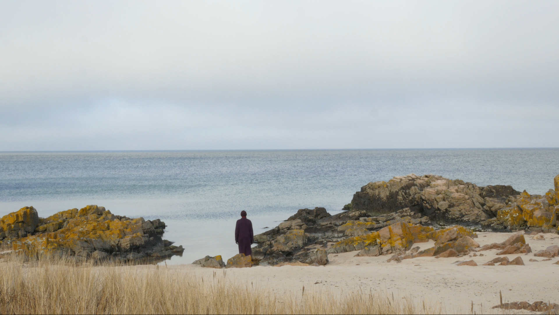
Lichen at Allinge 1-2, Arlander 2016