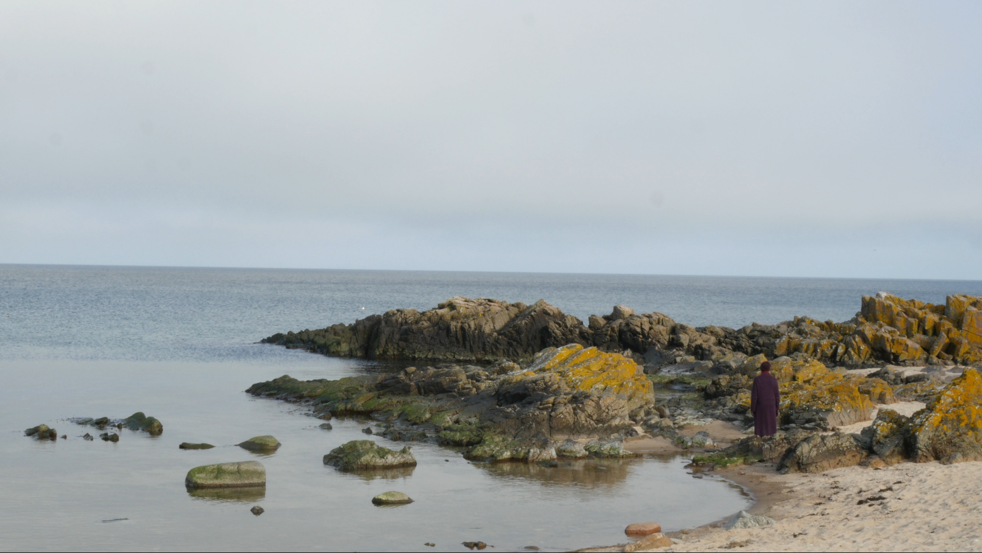
Lichen at Allinge 1-2, Arlander 2016