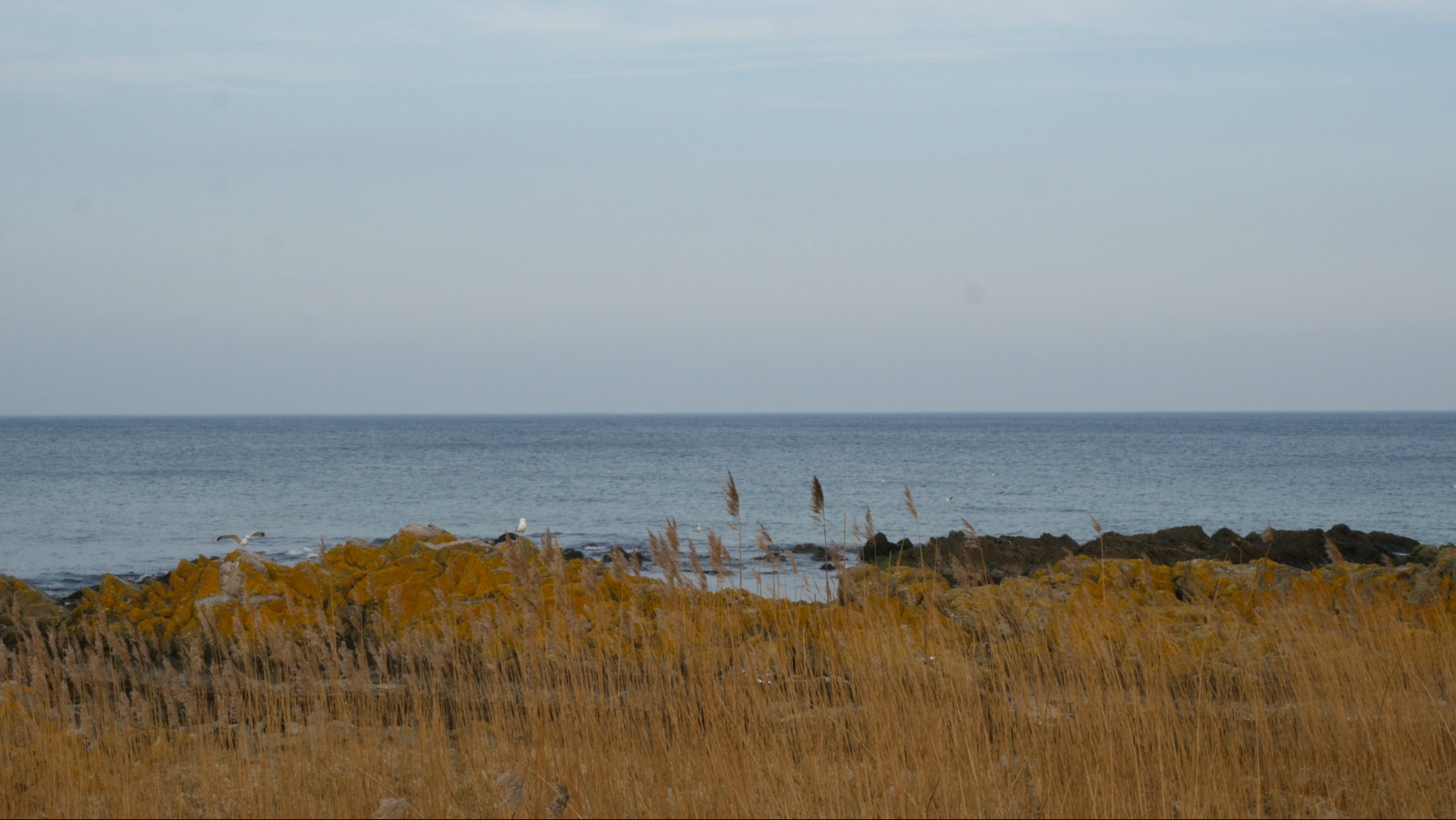
Lichen at Allinge 1-2, Arlander 2016