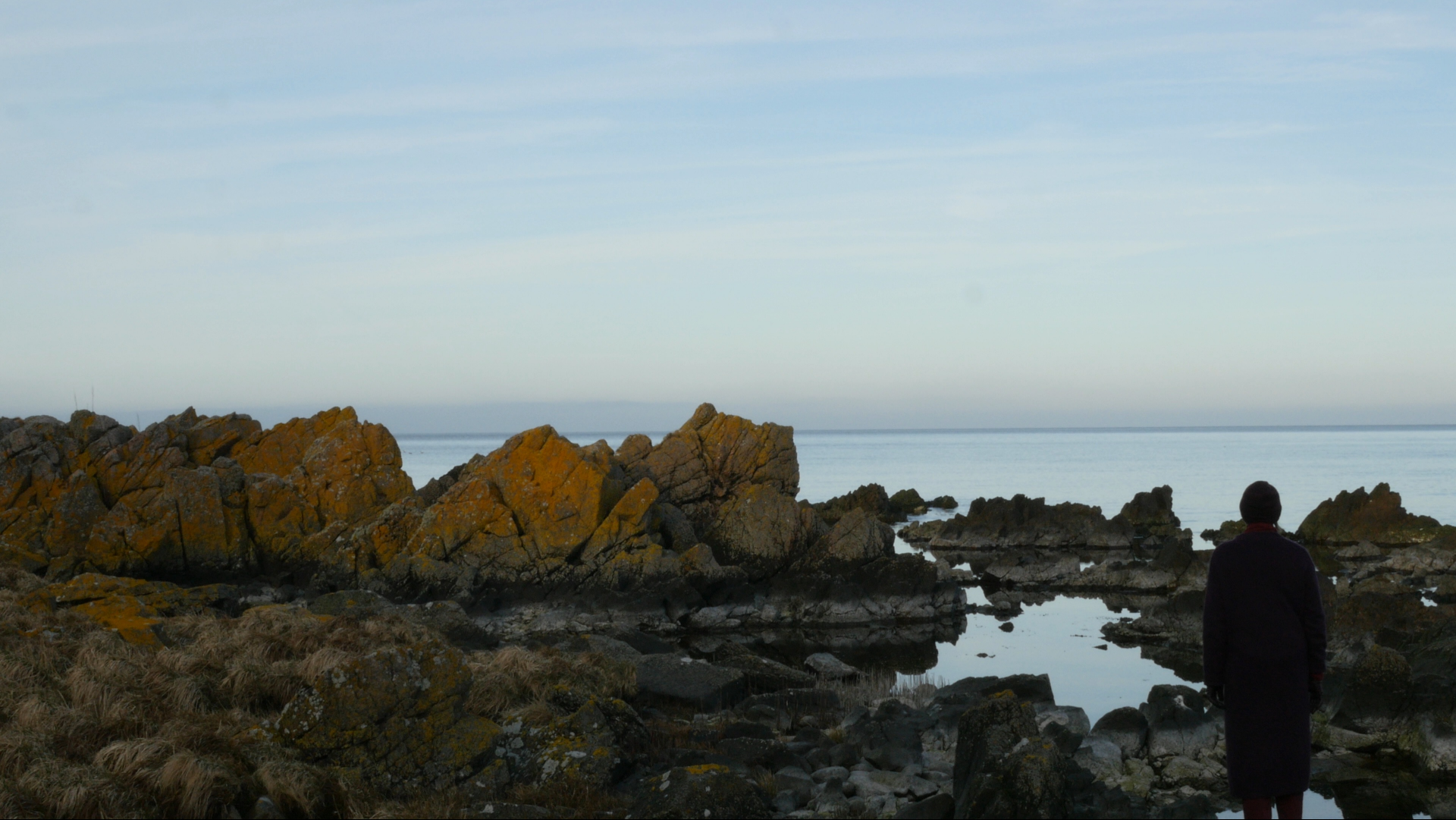
Lichen at Allinge 1-2, Arlander 2016