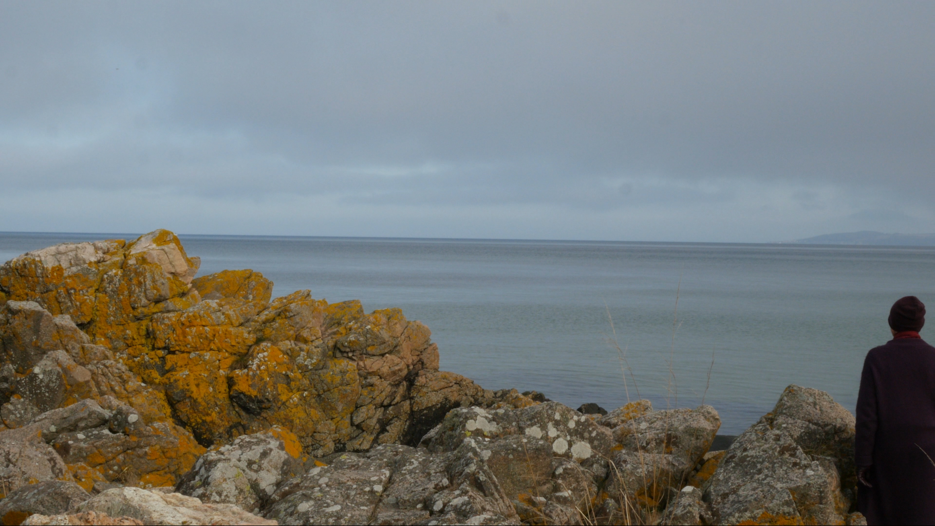
Lichen at Allinge 1-2, Arlander 2016