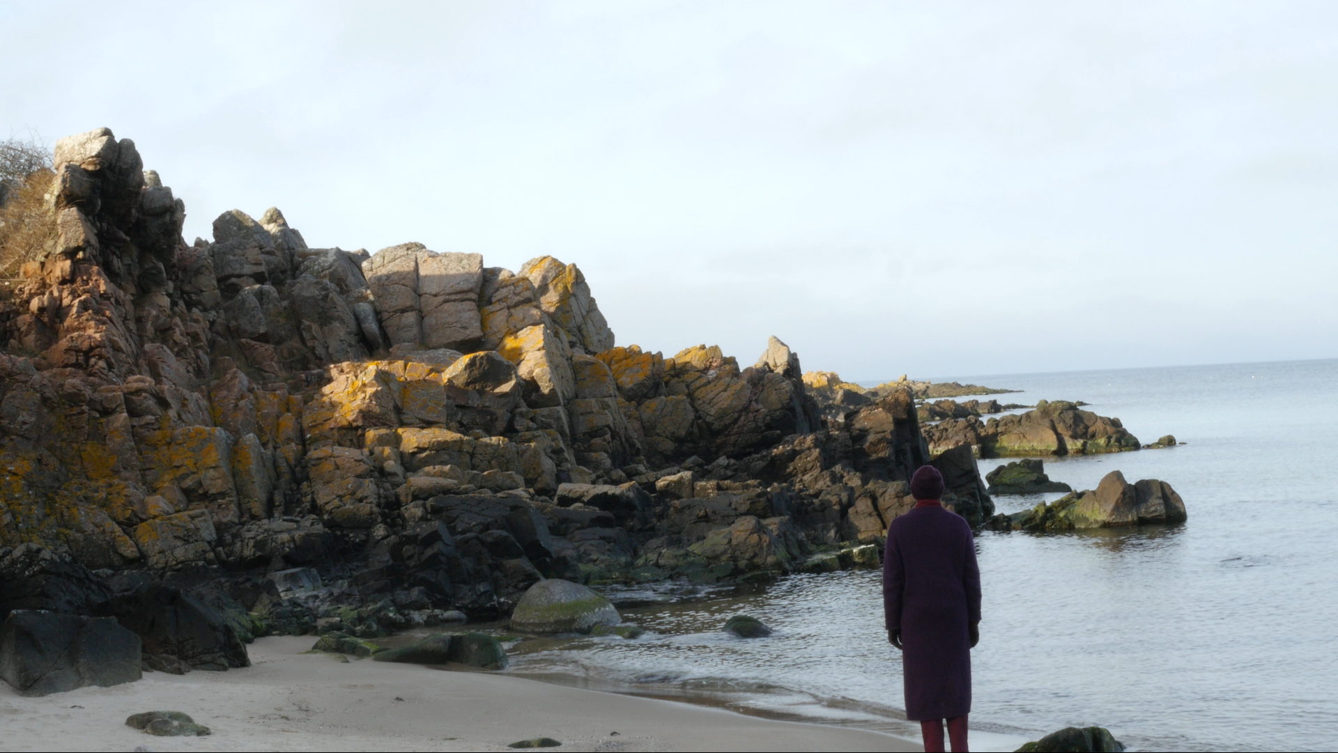
Lichen at Allinge 1-2, Arlander 2016